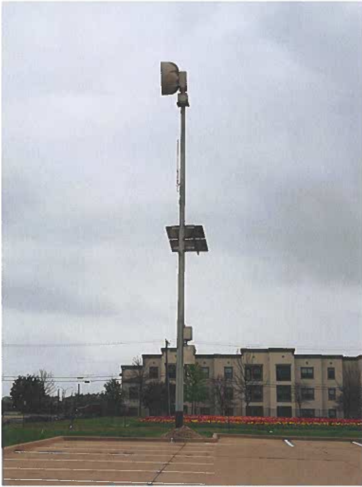
Emergency Weather Siren: Photo taken by WCC Staff