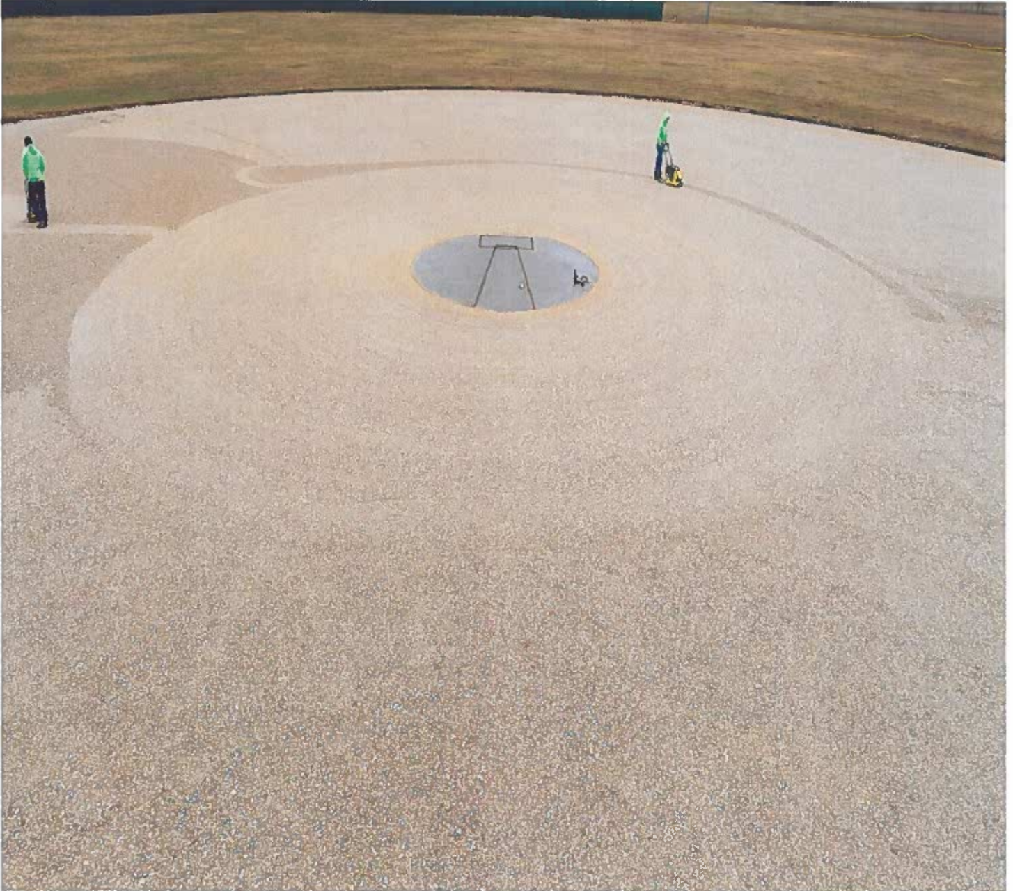
Baseball Field #7 Crushed Stone & Concrete Mound