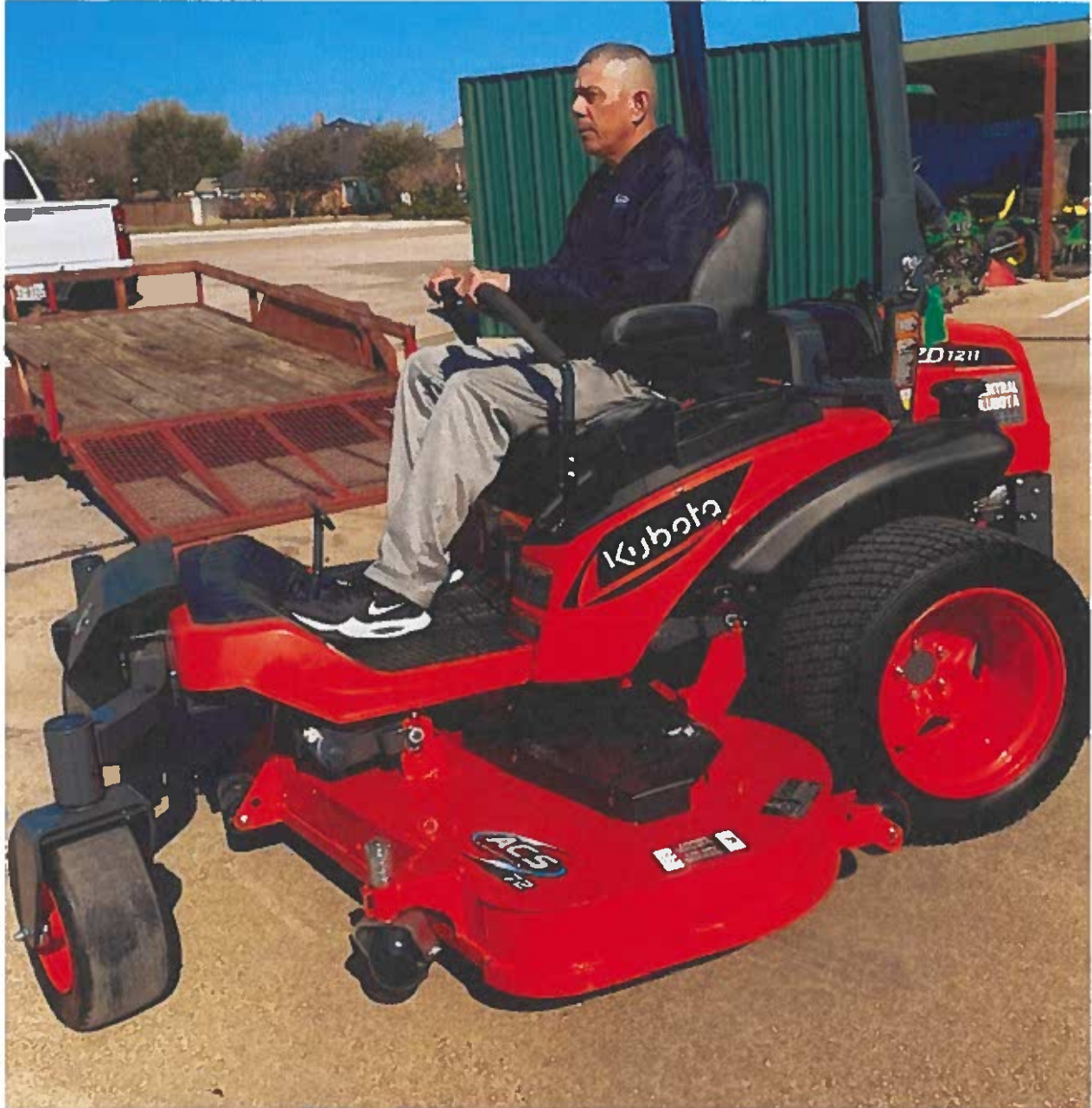
72" Kubota Mower