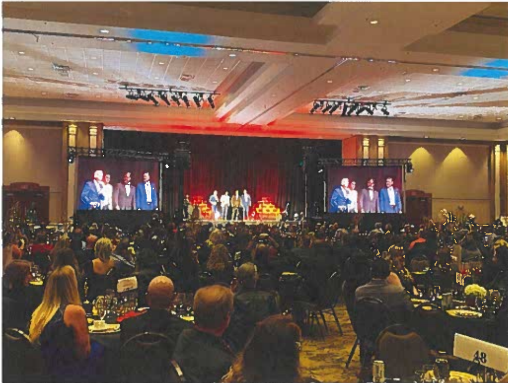
Semi-Private Event (Ballroom): Photo taken by WCC Staff