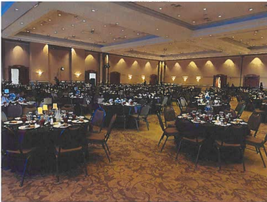
Semi-Private Event (Ballroom): Photo taken by WCC Staff