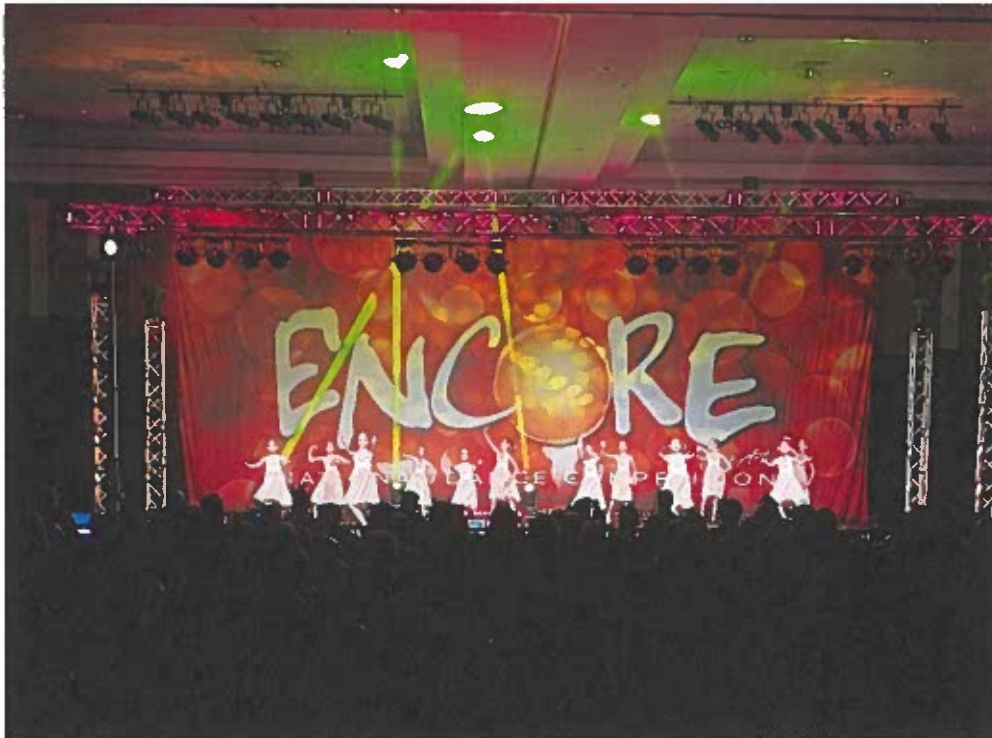
Public Event (Ballroom): Photo taken by WCC Staff