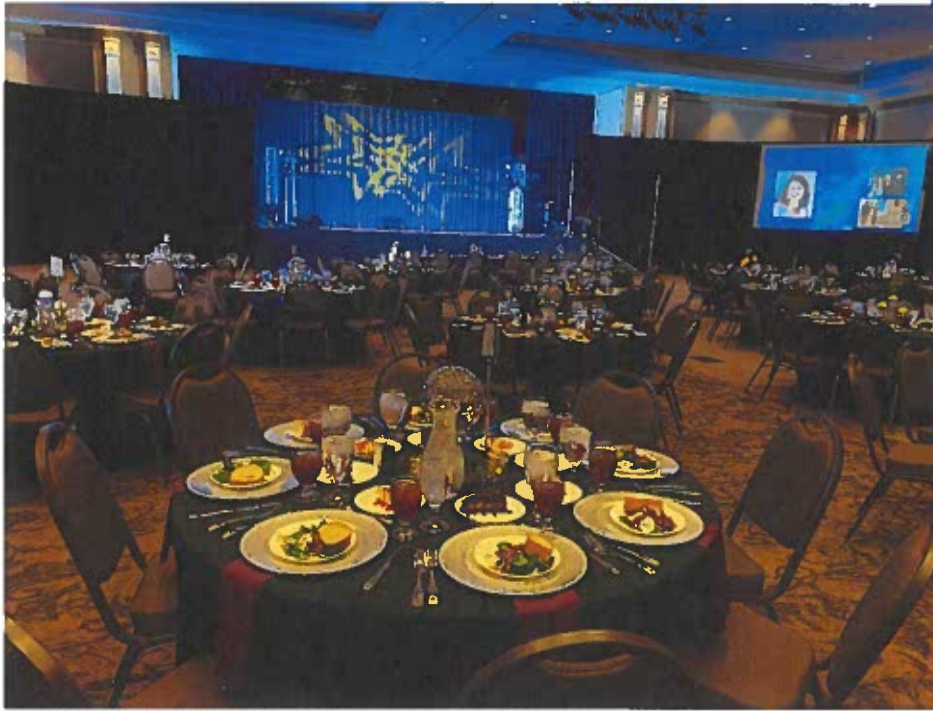
Semi-Private Event (Ballroom): Photo taken by WCC Staff