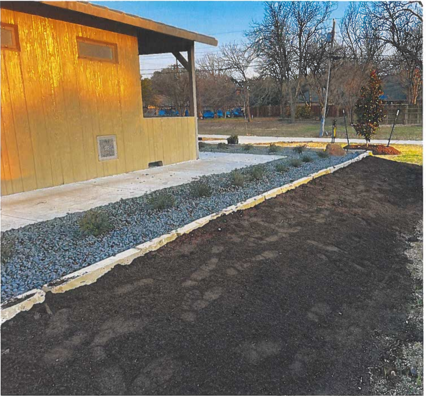
Chapman Park Restroom Landscape