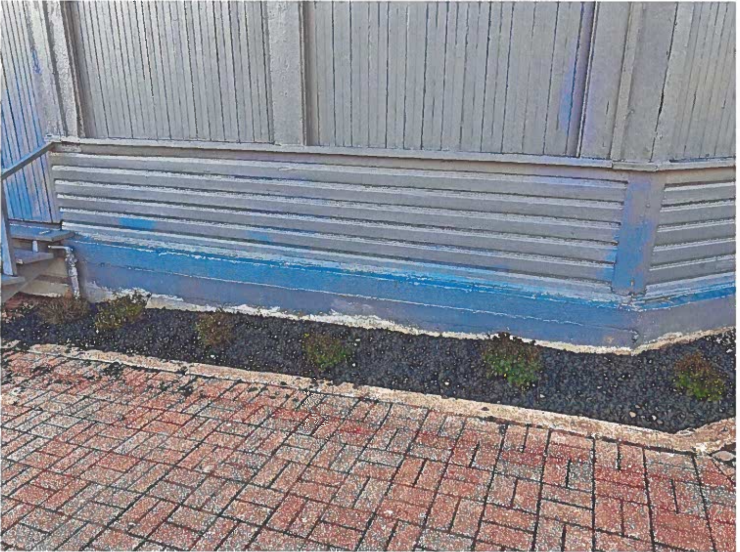
Chautauqua Phase 3 Landscape