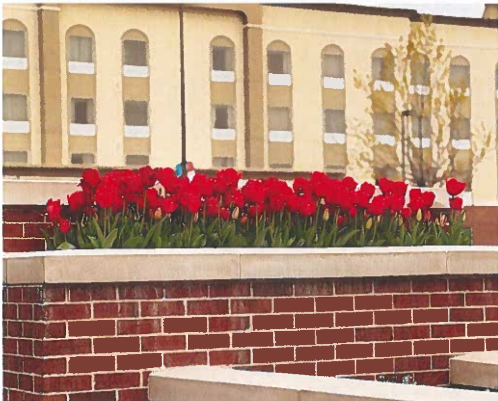
Star Plaza Planter: Photo taken by WCC Staff