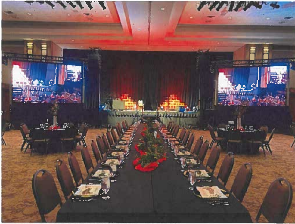
Semi-Private Event (Ballroom): Photo taken by WCC Staff