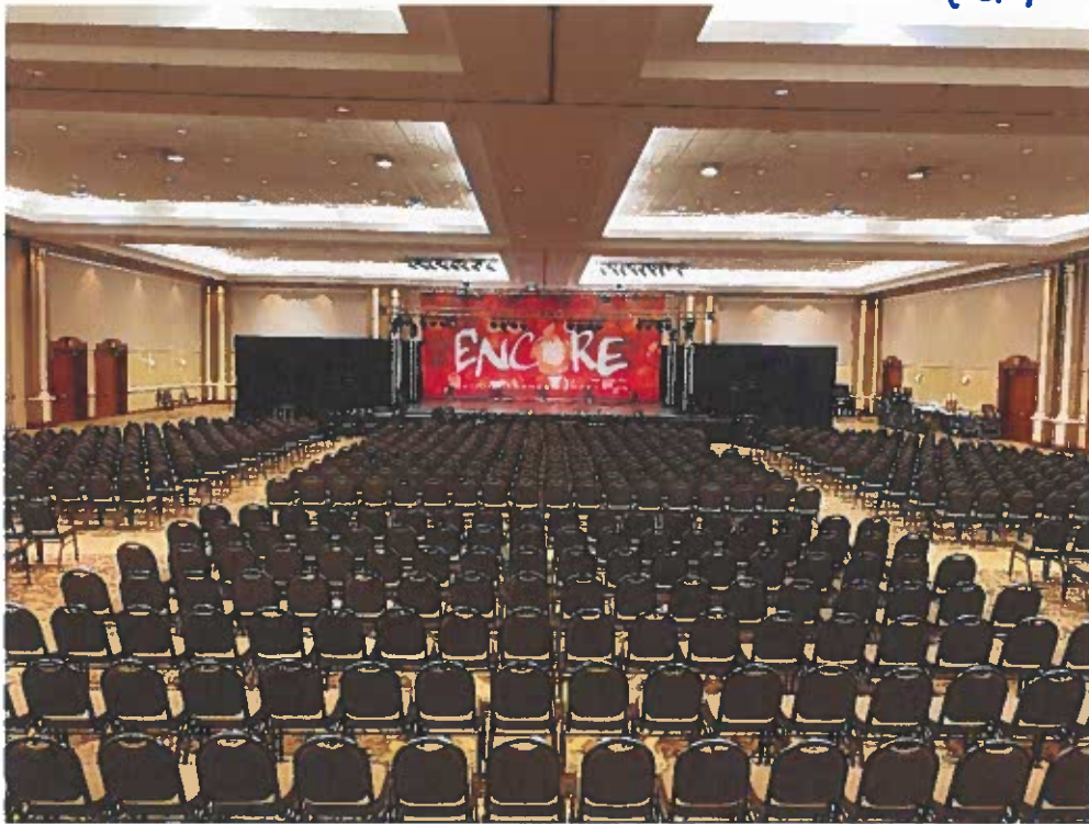
Public Event (Ballroom): Photo taken by WCC Staff