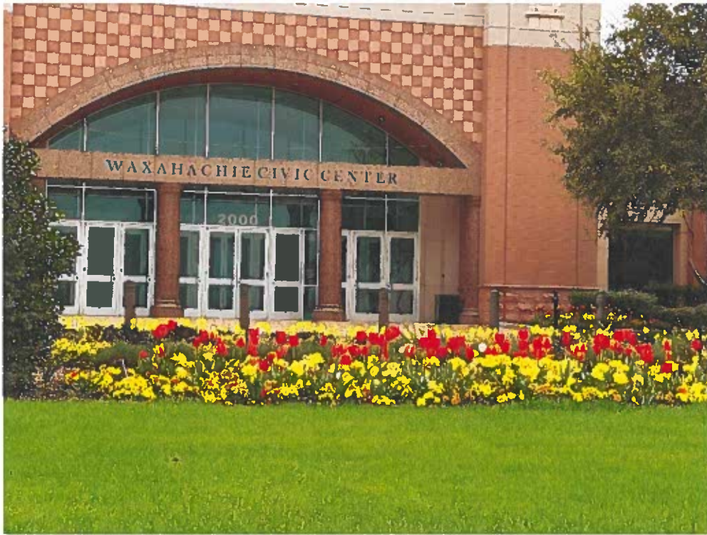
Front of Building: Photo taken by WCC Staff